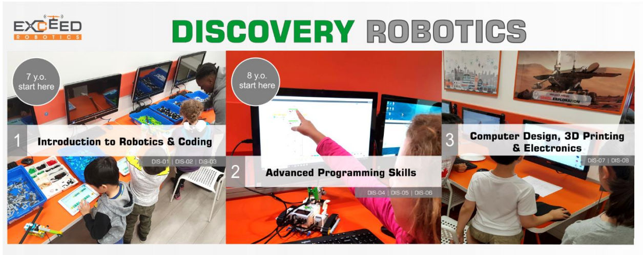
The Ultimate STEM Robotics Program for Inquisitive Minds

The Discovery Robotics curriculum focuses on teaching our youngest students Programming , Computer Design-3D Printing and Electronic Circuits in a hands-on, step-by-step approach.